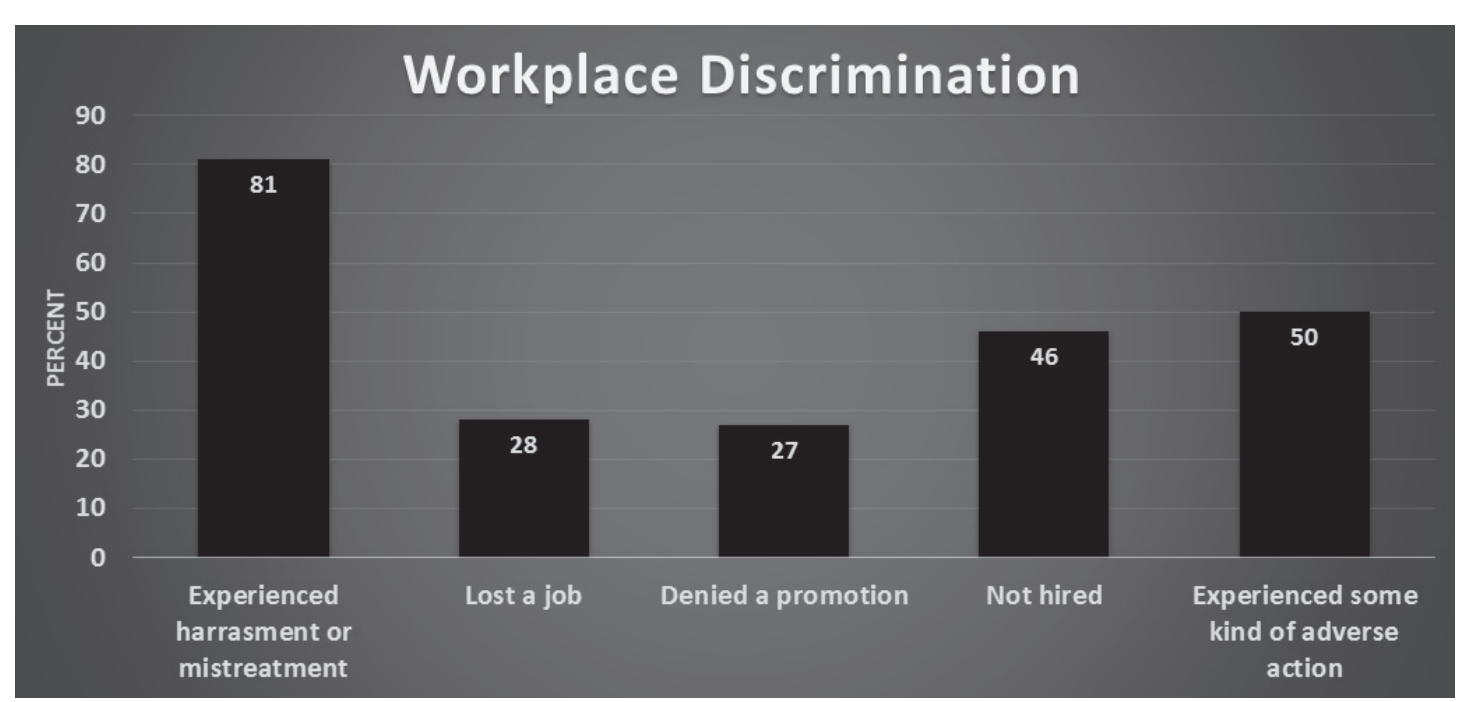
*Infographic statistics from the Findings of the National Transgender Discrimination Survey.